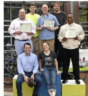
ABC TMA member Mass. General Hospital took home an award in this year's MassCommuter Challenge