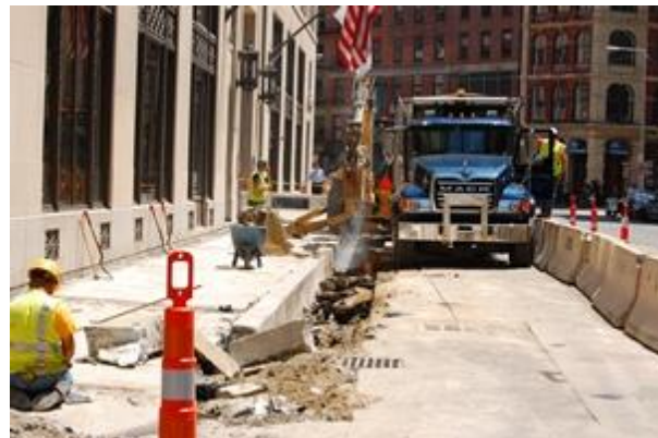
Crews at work on Broad Street

Broad Street is slated for completion next year; ABC will update