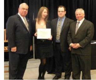
Mayor Menino presents ABC with a Green Business Award

The Bruins weren't the only Boston team to bring home the hardware this spring. ABC's Challenge for Sustainability and Transportation Management Association (TMA) garnered prizes as well. The Challenge was honored at Boston's Fifth Annual Green Business Awards, at a ceremony held at Atlantic Wharf, the city's first green skyscraper.