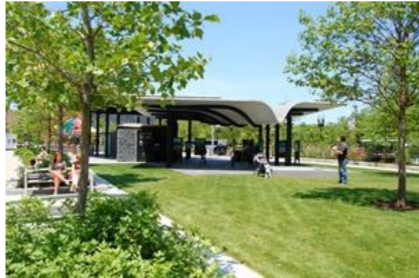
The new Harbor Islands Pavilion on the Greenway

Summer is here, and the Greenway is looking better and better. This spring saw the opening of the Harbor Islands Pavilion , the first permanent structure to be built on the Greenway. ABC attended the opening ceremony, which featured remarks by Mayor Thomas