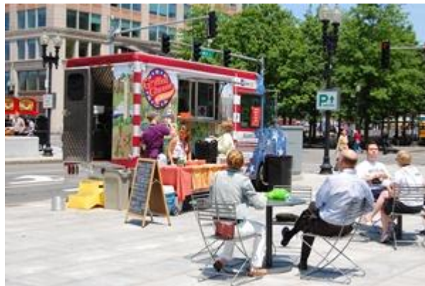
Grilled Cheese Nation, one of the Greenway's new food trucks