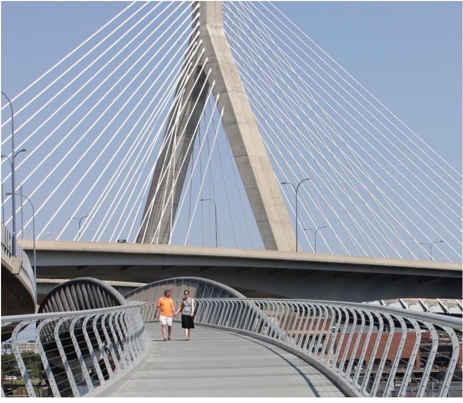
FIGURE 2: NORTH BANK PEDESTRIAN BRIDGE IN BOSTON/CAMBRIDGE ($29.5 MILLION)

The North Bank Bridge is a pedestrian bridge that connects Charlestown in Boston to Cambridge, traveling over the commuter rail lines near North Station. The project is part of the environmental mitigation agreements related to the Central Artery / Tunnel Project. Initial design work took place four years before ARRA.