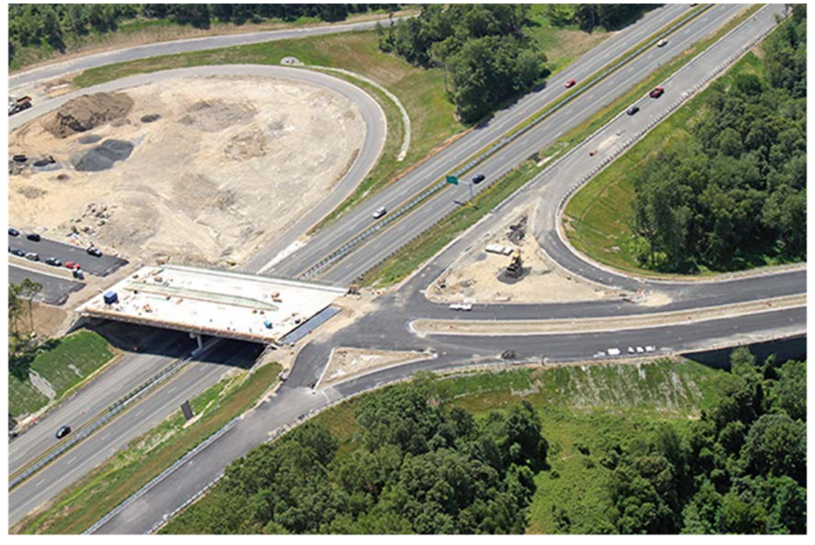
FIGURE I: RT. 24 INTERCHANGE CONSTRUCTION IN FALL RIVER / FREETOWN ($32.7 MILLION)

The project created a new entrance and exit ramp between Exits 8 and 9 on Route 24 in Fall River/ Freetown and made new connections to the local road network and providing access to the new Fall River Executive Park. MassDOT Blog, Freetown Route 24 Exit 8B Public Hearing Set <u>2.1.10</u>