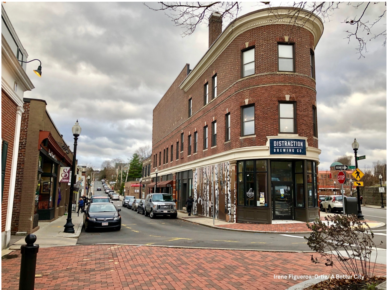
Figure 1: Photo of Birch Street