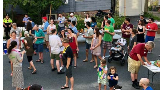
Community Engagement Participación de la Comunidad