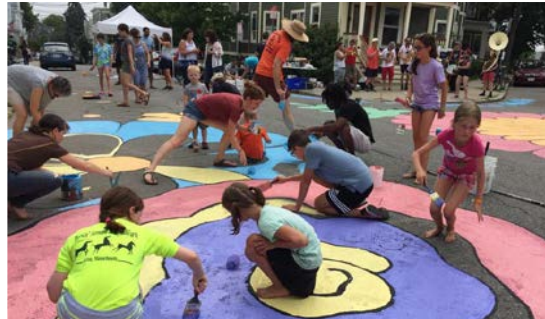
Community Art Arte Comunitario