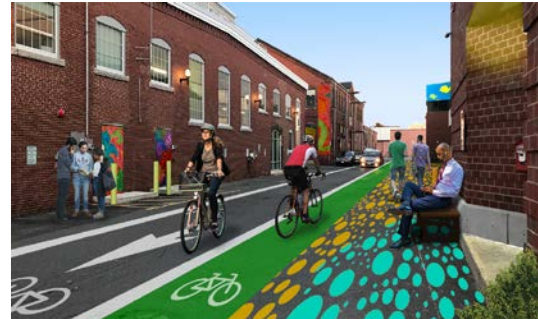
Placemaking + Space Activation Activación del Espacio