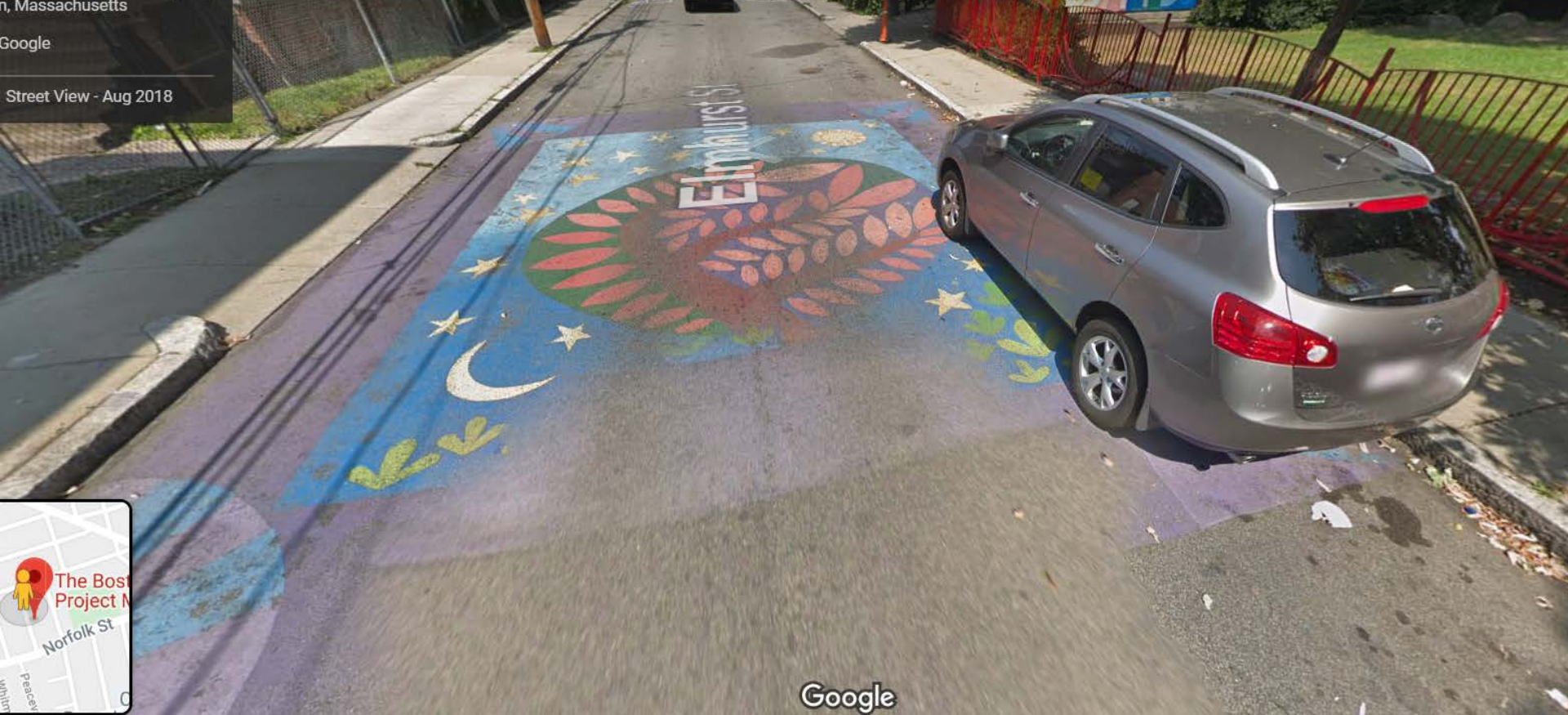
Streetview 2 years later