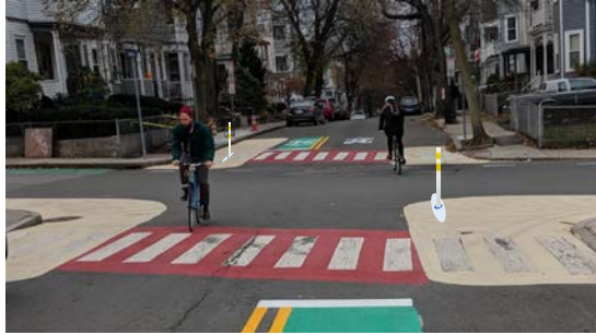
Traffic Calming + Tactical Urbanism Calmar Tráfico + Urbanismo Táctico